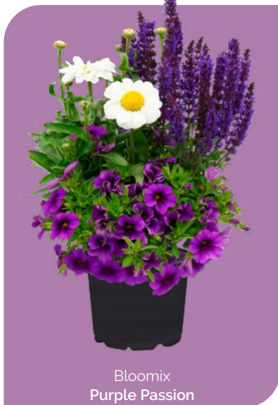
Bloomix Purple Passion