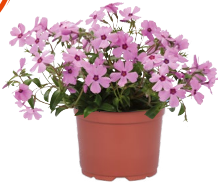
Phlox hybrida Woodlander Rose 77238