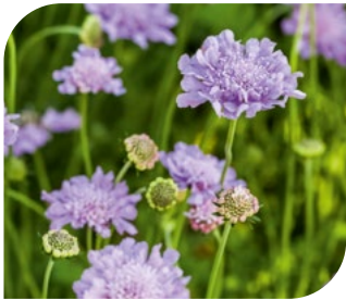
Scabiosa columbaria Butterfly Blue 80223