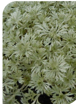
Artemisia schmidtiana Silver Mound 81768