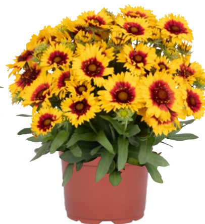
Gaillardia aristata SpinTop™ Red Starburst Imp 62548