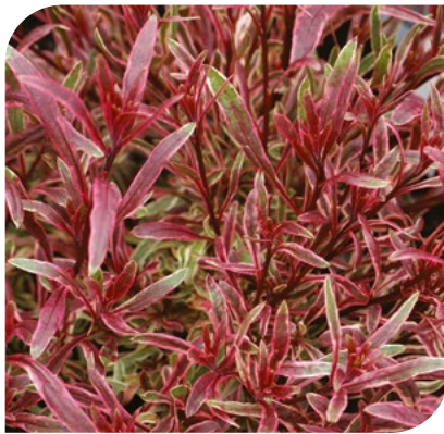
Gaura lindheimeri Passionate Rainbow 71319