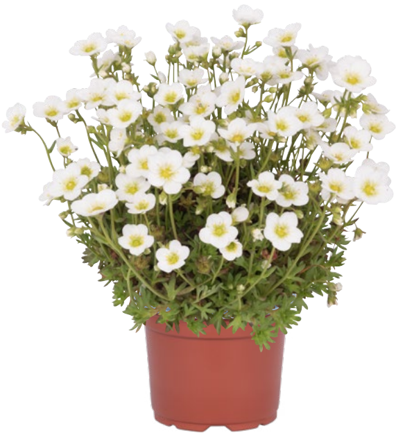
Saxifraga arendsii Scenic White 82121