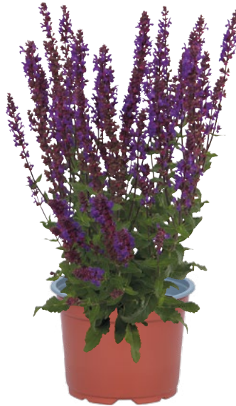
Salvia nemorosa Caramia 80708