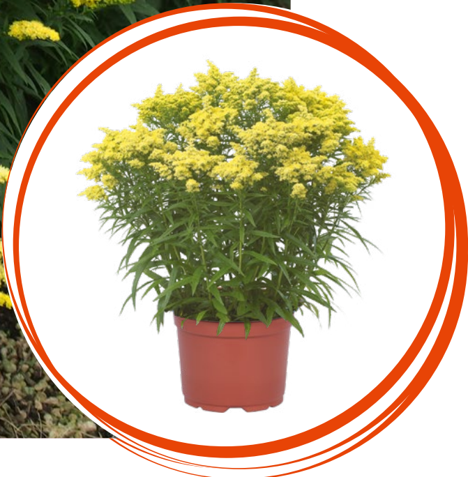
Solidago canadensis Sweety 80247