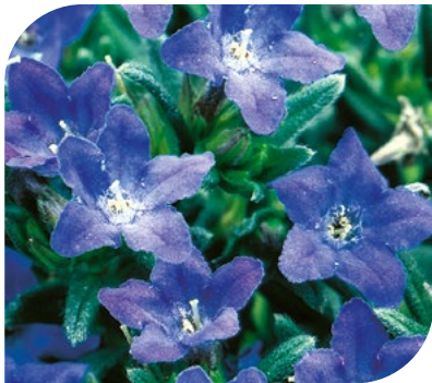
Lithodora diffusa Grace Ward 82301