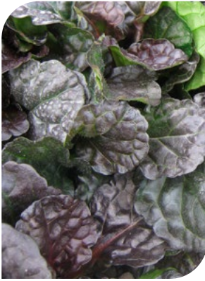
Ajuga reptans Black Scallop 76014