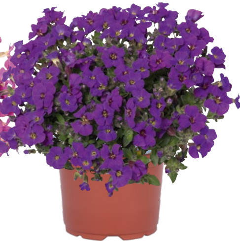
Aubrieta gracilis Rock On Purple 82101