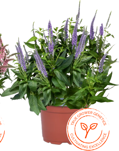
Veronica Candela Blue 88106