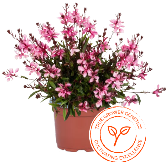
Gaura lindheimeri Graceful Pink 71341