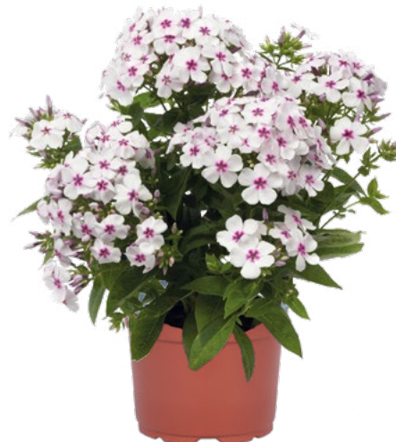
Phlox paniculata Flame® White Eye 80181