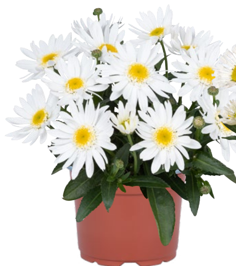
Leucanthemum maximum Sweet Daisy™ Birdy 80621