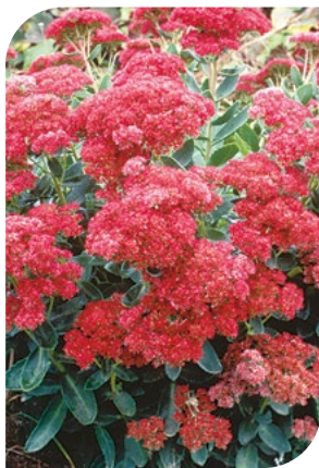
Sedum telephium Autumn Joy 82013