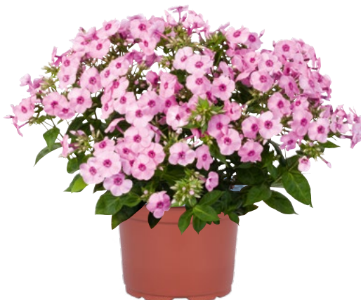
Phlox paniculata Flame® PRO Pink Pop 81130