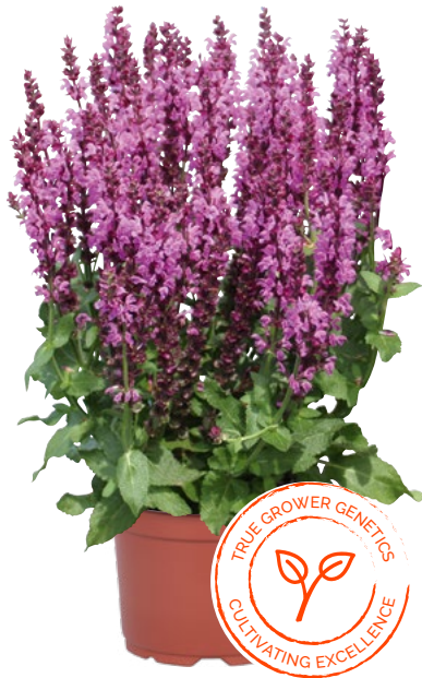
Salvia nemorosa Royal Magenta 81172