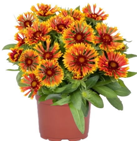
Gaillardia aristata SpinTop™ Mariachi Copper Sun 62533