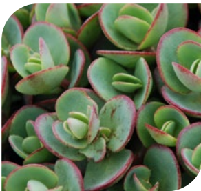
Sedum cauticola Sun Sparkler® Lime Zinger 81974