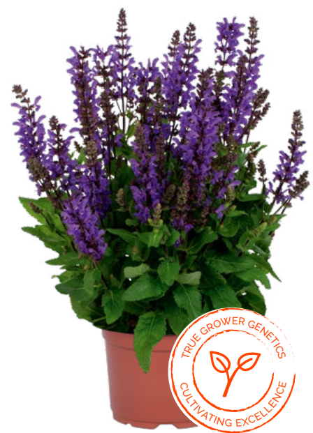
Salvia nemorosa Noble Night 87138