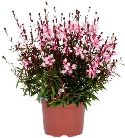
Gaura lindheimeri Monarch Pink 71345