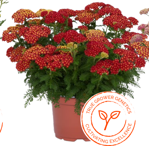
Achillea millefolium Skysail Fire 80526