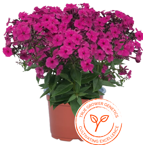
Phlox paniculata Magenta 81098