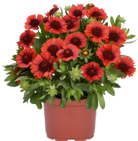
Gaillardia aristata SpinTop™ Red 62451