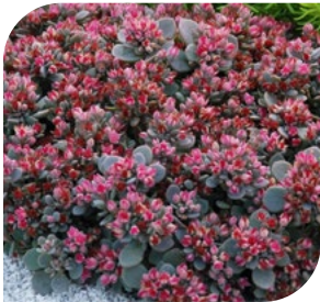
Sedum cauticola Sun Sparkler® Blue Elf 81970