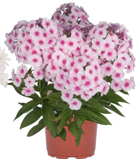
Phlox paniculata Flame® PRO Soft Pink 80438