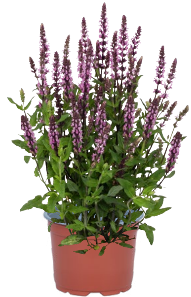
Salvia nemorosa Caramia Rosa 87115