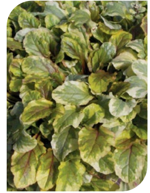
Ajuga reptans Golden Glow 76017