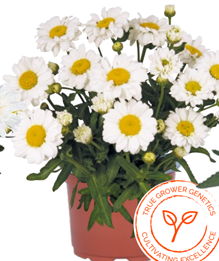
Leucanthemum maximum Sweet Daisy™ Jane 80393