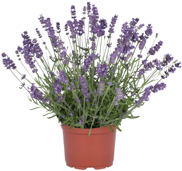
Lavandula angustifolia LaDiva Spirit Purple Blue 81895