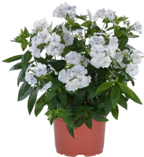
Phlox paniculata Flame® Light Blue 80171