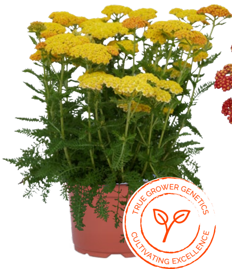
Achillea millefolium Skysail Yellow 81073