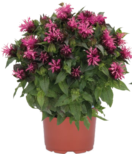
Monarda didyma Pocahontas Pink 78059