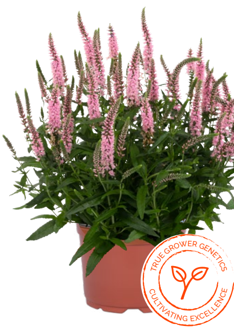
Veronica Candela Pink 88104