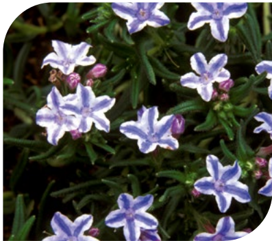
Lithodora diffusa Star 82303