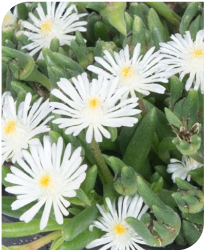
Delosperma cooperi Rock Chrystal White 81252