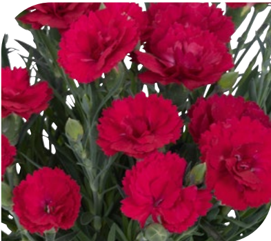
Dianthus caryophyllus Rock Double Red 17945