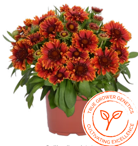
Gaillardia aristata SpinTop™ Yellow Touch 62456