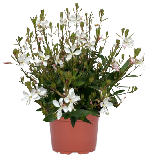
Gaura lindheimeri Monarch White 71350