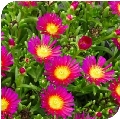
Delosperma cooperi Solstice Purple Bicolor 81266