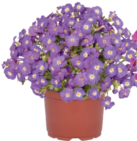
Aubrieta gracilis Rock On Blue 82102