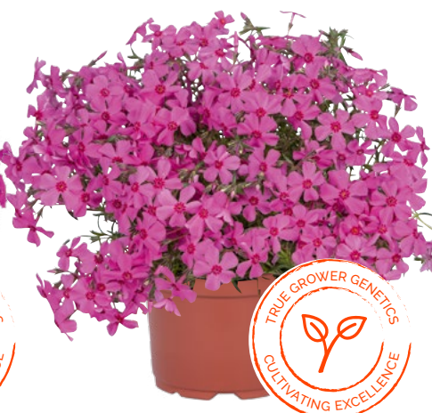
Phlox subulata Spring® Pink 82137