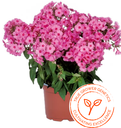
Phlox paniculata Flame® Pink 80174