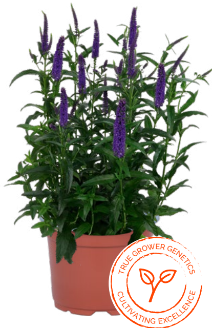
Veronica Candela Purple 88157