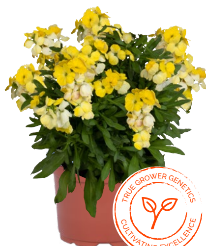
WallArt Citric 82165