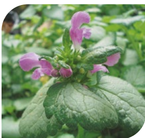
Lamium maculatum Red Nancy 78152