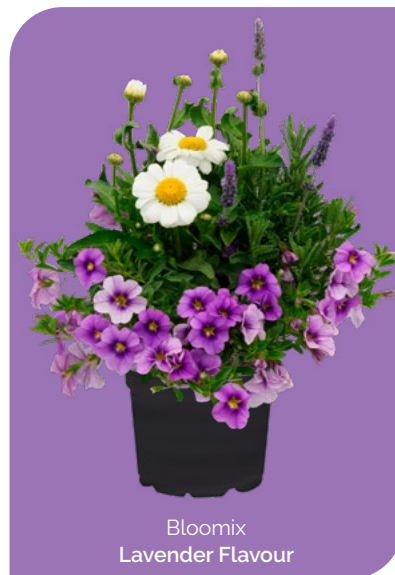
Bloomix Lavender Flavour