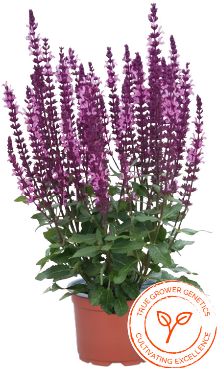
Salvia nemorosa Midnight Rose 81144