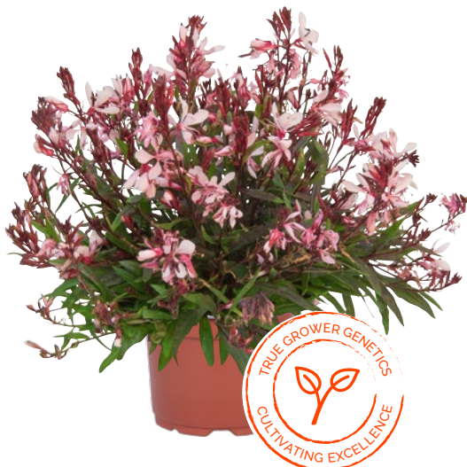
Gaura lindheimeri Graceful Light Pink 71324