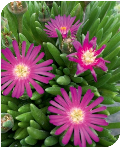
Delosperma cooperi Rock Chrystal Purple 81530