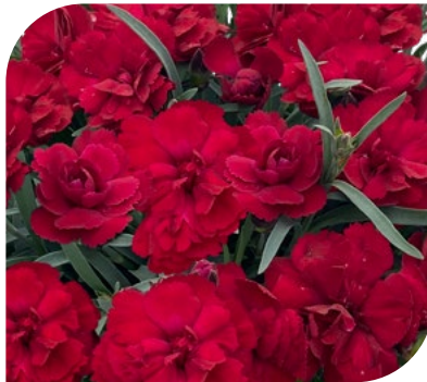
Dianthus caryophyllus Paddock Red 17927