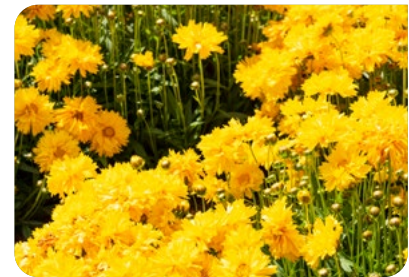
Coreopsis grandiflora MoonSwirl 82161