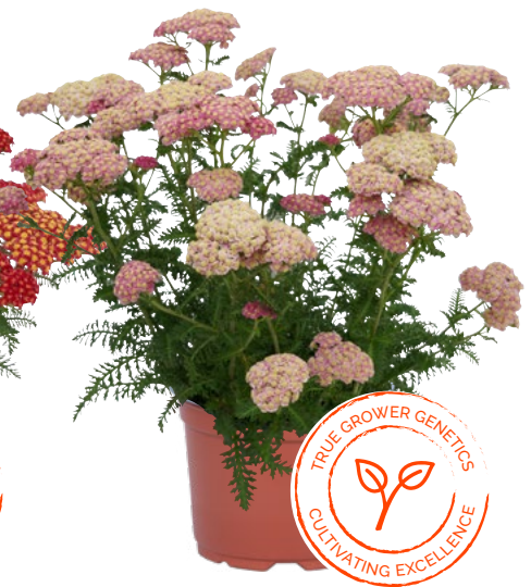
Achillea millefolium Skysail Bright Pink 81074