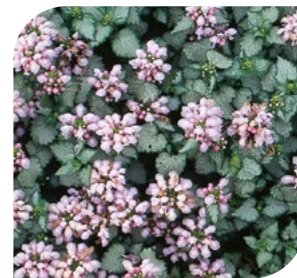
Lamium maculatum Pink Pewter 83806