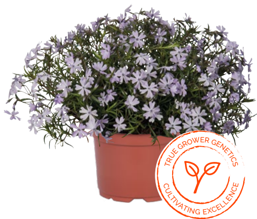
Phlox subulata Spring® Lavender 80155