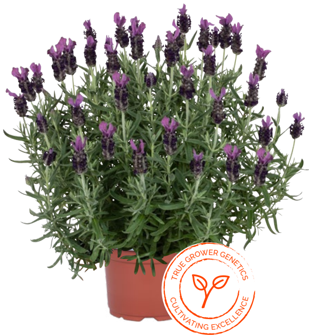
Lavandula stoechas LaDiva Big Night 78219