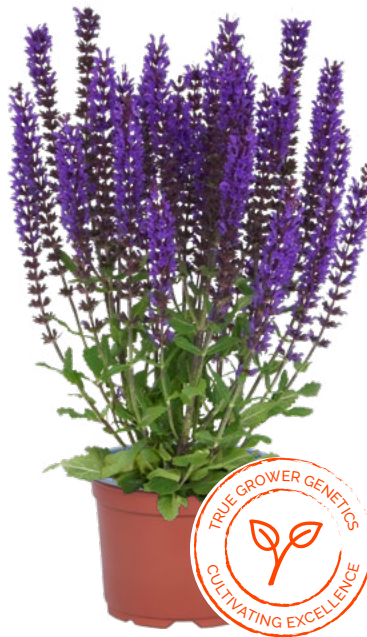
Salvia nemorosa Noche 87113