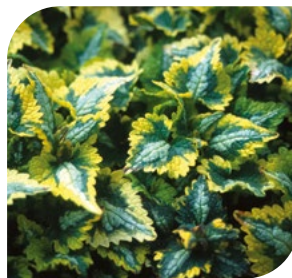
Lamium maculatum Golden Anniversary 83805