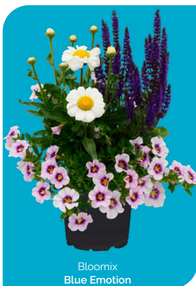
Bloomix Blue Emotion