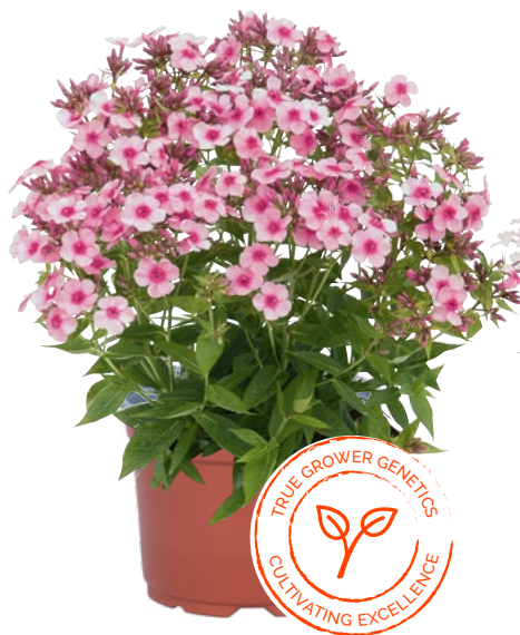
Phlox paniculata Early® Pink 80920