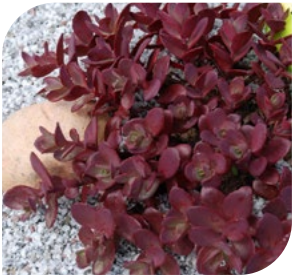
Sedum cauticola Sun Sparkler® Cherry Tart 81971