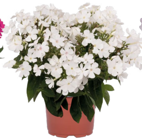
Phlox paniculata Flame® PRO White 80939