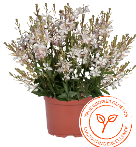
Gaura lindheimeri Graceful White 71338