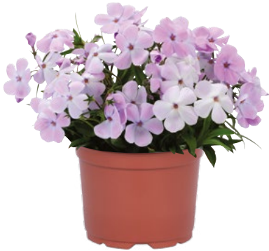
Phlox hybrida Woodlander Lilac 77237