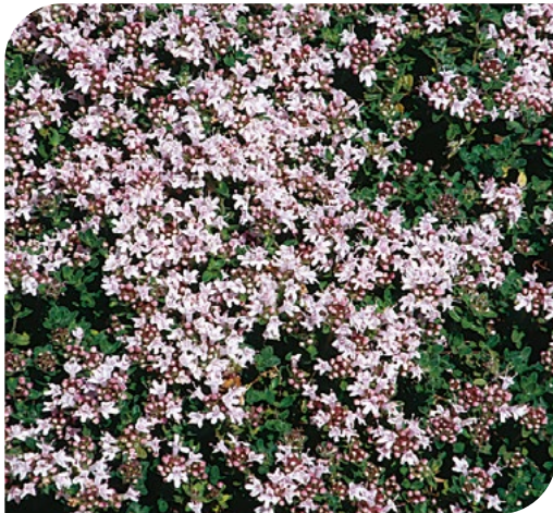
Thymus Pink Chintz 82029