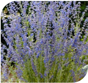
Perovskia atriplicifolia Little Spire 80199