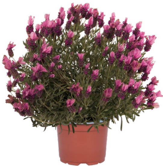
Lavandula stoechas LaDiva Papillon Deep Rose 78771