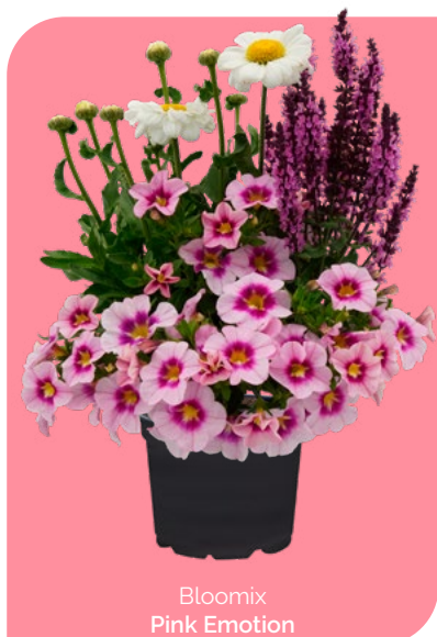
Bloomix Pink Emotion