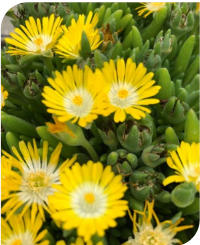
Delosperma cooperi Rock Chrystal Yellow 84100