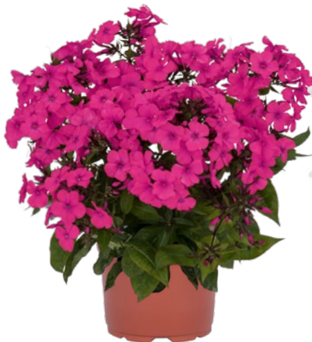
Phlox paniculata Flame® PRO Cerise 80434