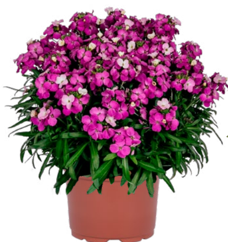
WallArt Lavender 82278