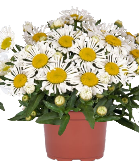
Leucanthemum maximum Sweet Daisy™ Sofie 80624