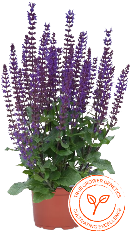
Salvia nemorosa Midnight Purple 81143