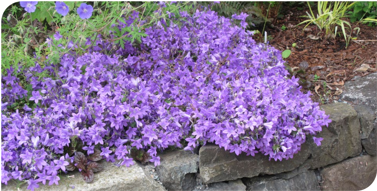
Campanula portenschlagiana Blue 81773