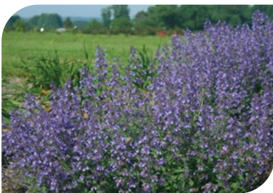
Nepeta faassenii Junior Walker™, Novanepjun' 82504