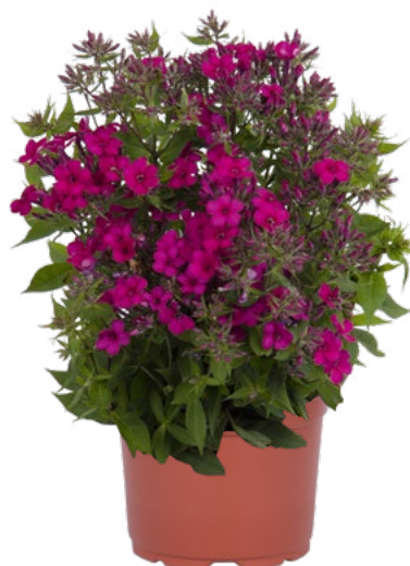
Phlox paniculata Early® Cerise 80442