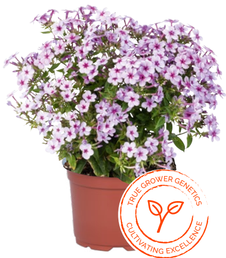
Phlox paniculata Early® Lavander Pop 81156