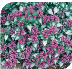
Lamium maculatum Purple Dragon 83807