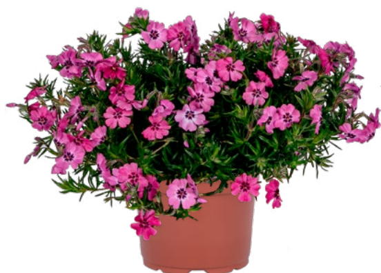
Phlox subulata Spring® Late Pink 82131