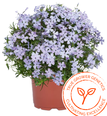
Phlox subulata Spring® Blue 82140