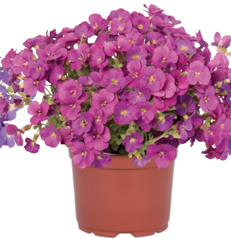
Aubrieta gracilis Rock On Pink 80895