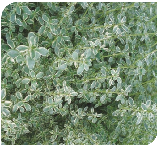
Thymus Hi-Ho Silver 88006