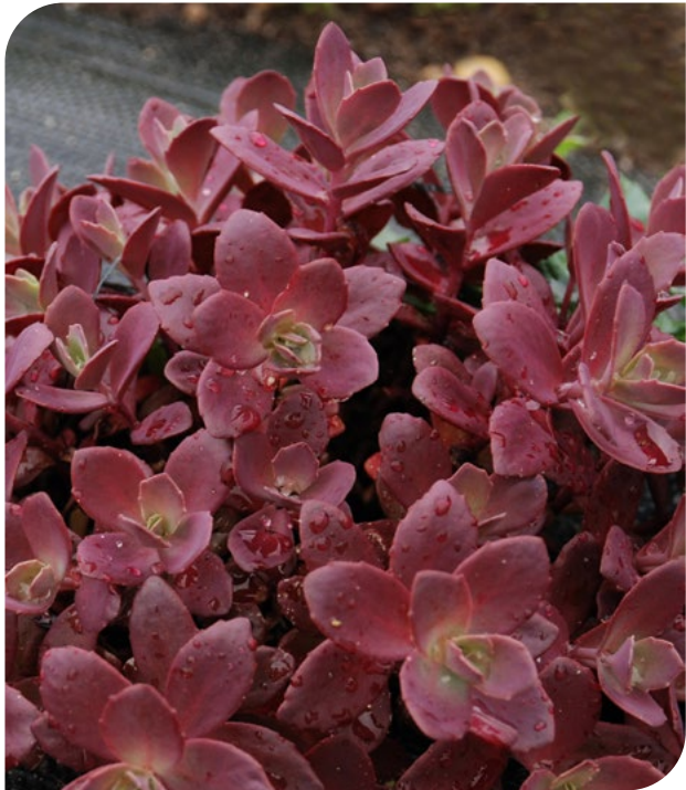
Sedum cauticola Sun Sparkler® Firecracker 81973