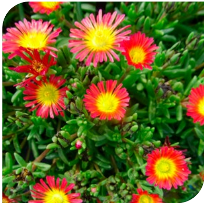
Delosperma cooperi Solstice Red 84109