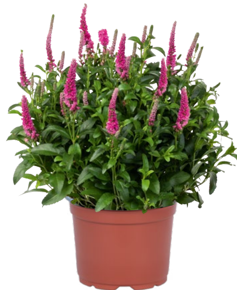
Veronica Candela Hot Pink 88156