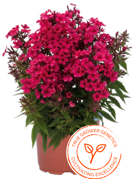
Phlox paniculata Early® Red 80378