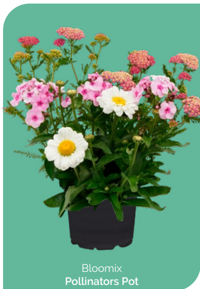
Bloomix Pollinators Pot