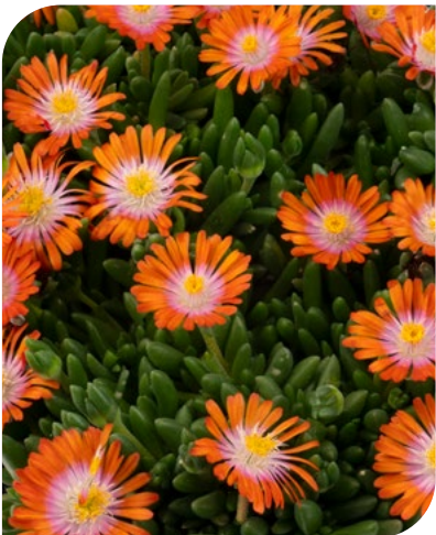
Delosperma cooperi Rock Chrystal Orange 81253