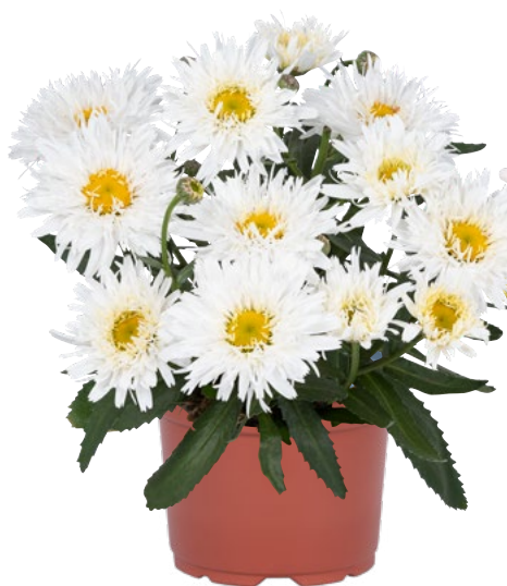
Leucanthemum maximum Sweet Daisy™ Rebecca 81090