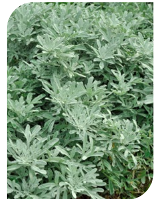
Artemisia stelleriana Silver Brocade 81769