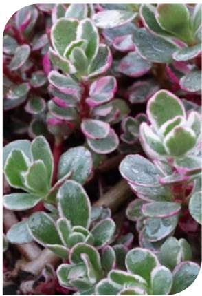
Sedum spurium Tricolor 82011