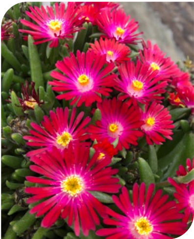
Delosperma cooperi Rock Chrystal Red 81533