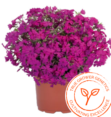
Phlox subulata Spring® Hot Pink 80425