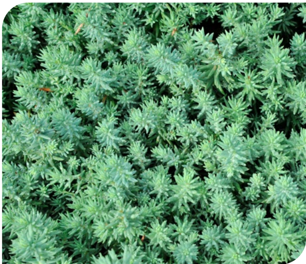
Sedum reflexum Blue Spruce 81992