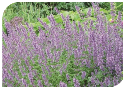
Nepeta faassenii Walkers Low 82505