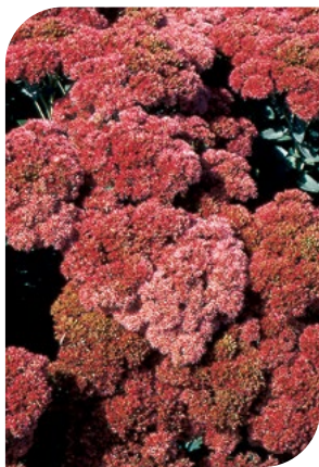
Sedum telephium Autumn Fire 82012