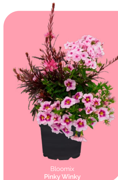
Bloomix Pinky Winky