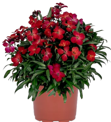
Intense Joy 82287