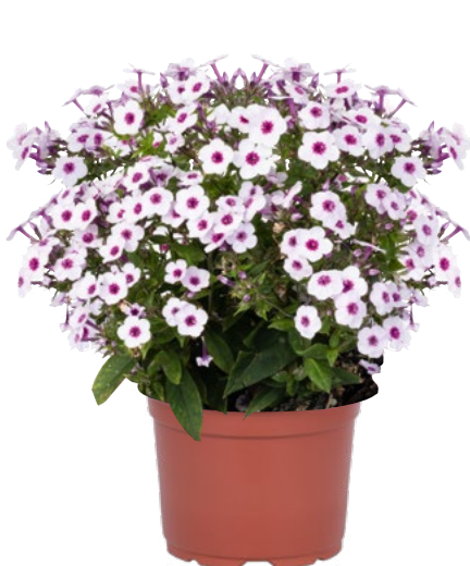
Phlox paniculata Early® Blush Pop 81160