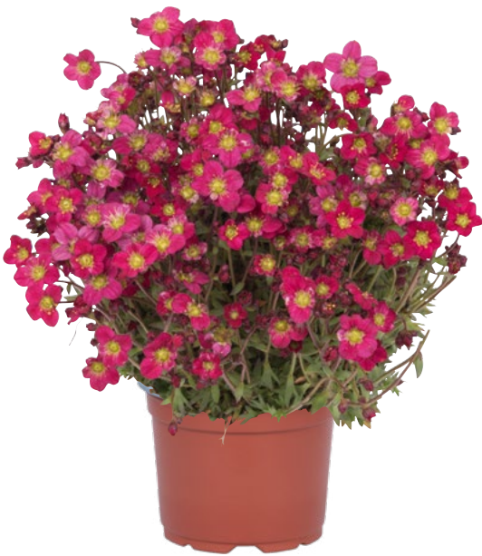
Saxifraga arendsii Scenic Red 82122