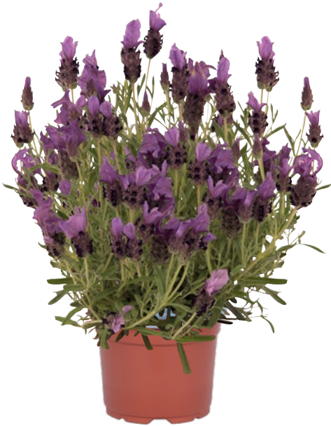
Lavandula stoechas LaDiva Papillon Purple 78776