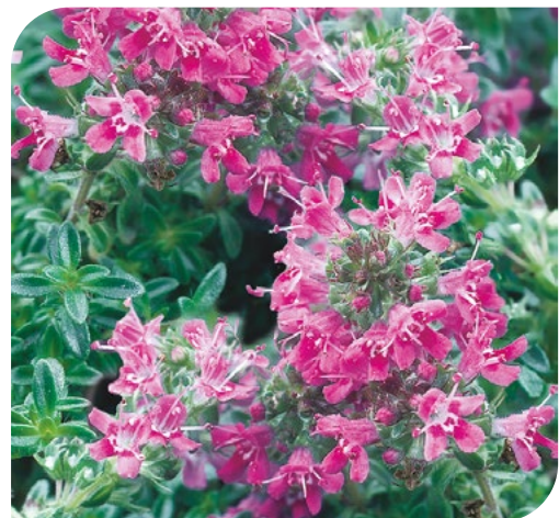
Thymus Red Creeping 82027