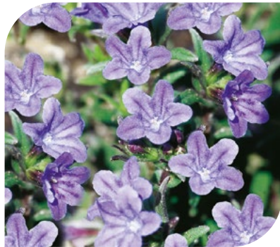
Lithodora diffusa Heavenly Blue 82302