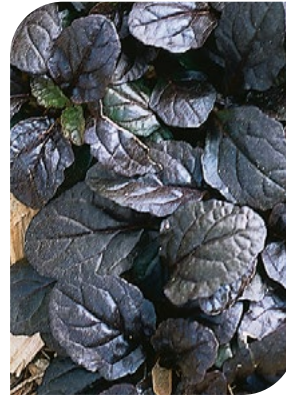
Ajuga reptans Mahogany 76018