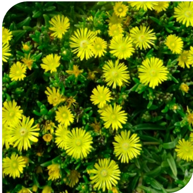
Delosperma cooperi Solstice Yellow 84106