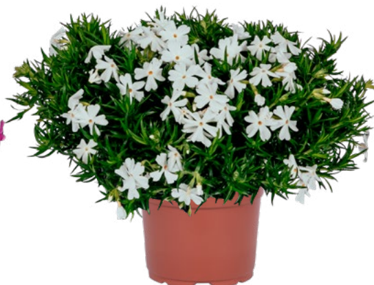
Phlox subulata Spring® Late White 82134