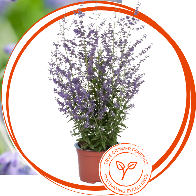
Perovskia atriplicifolia Jelena 88411