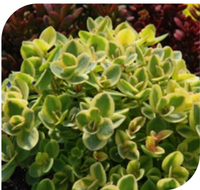
Sedum makinoi Sun Sparkler® Lime Twister 81984