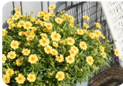
Coreopsis auriculata Limoncello 81781