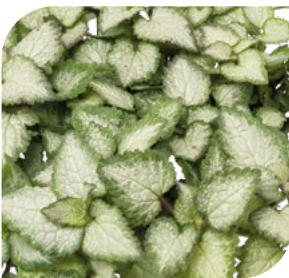
Lamium maculatum Beacon Silver 83802