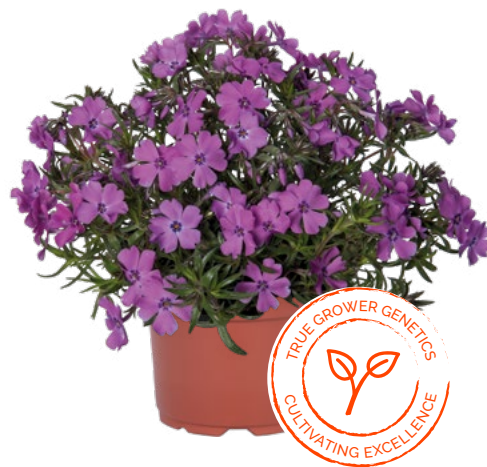
Phlox subulata Spring® Purple 80157