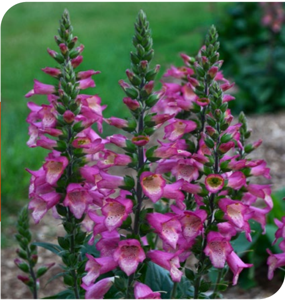
Digiplexis x hybrida Berry Canary 80783