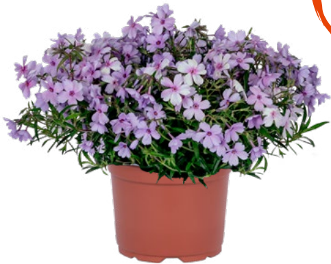
Phlox hybrida Woodlander Periwinkle 81062