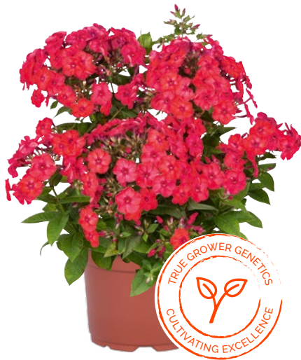
Phlox paniculata Flame® Watermelon 81131