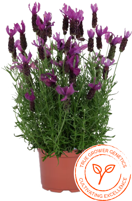
Lavandula stoechas LaDiva Berry Beautiful 78244