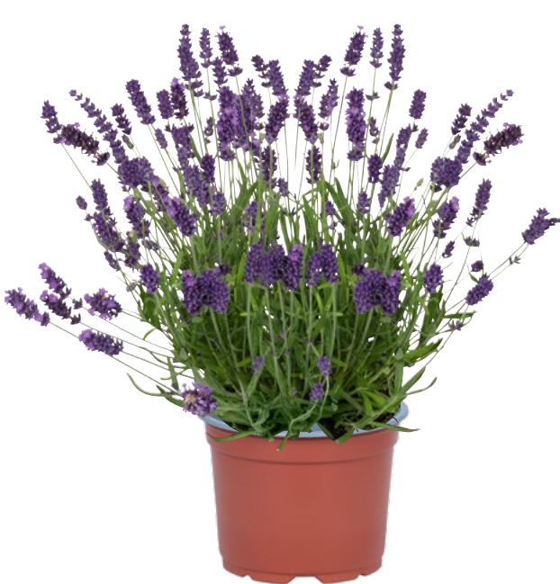
Lavandula angustifolia LaDiva Vintage Violet 78214