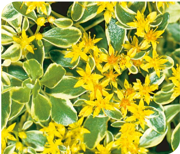
Sedum kamtschaticum Variegatum 81982