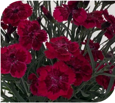
Dianthus caryophyllus Cliff Garnet Splash 17983