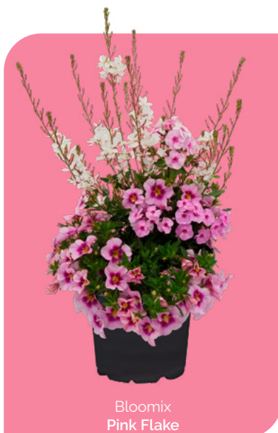
Bloomix Pink Flake