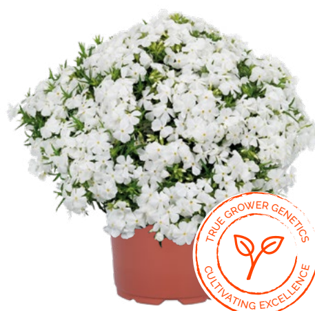
Phlox subulata Spring® White 80158