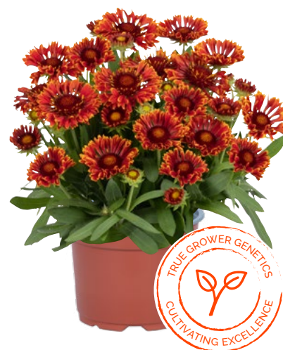
Gaillardia aristata SpinTop™ Mariachi Red Sky 62550