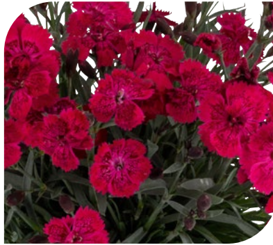
Dianthus caryophyllus Cliff Purple Spot 17745