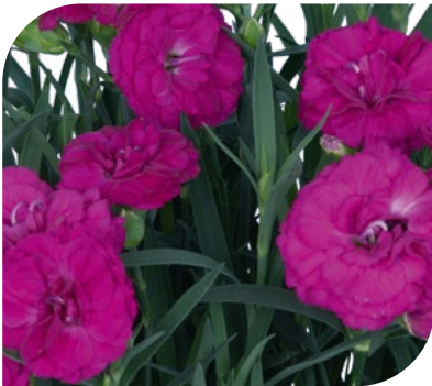
Dianthus caryophyllus Paddock Violet 17774