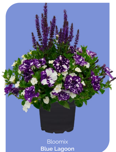
Bloomix Blue Lagoon