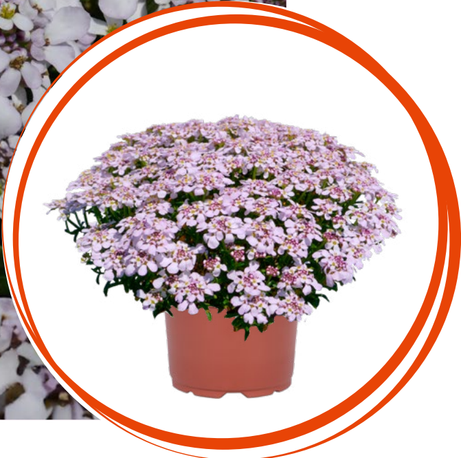
Iberis hybrid Candy Sorbet 83717