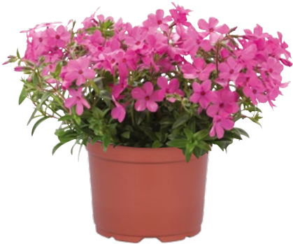
Phlox hybrida Woodlander Pink 77239