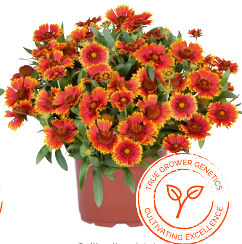
Gaillardia aristata SpinTop™ Orange Halo Imp 62530