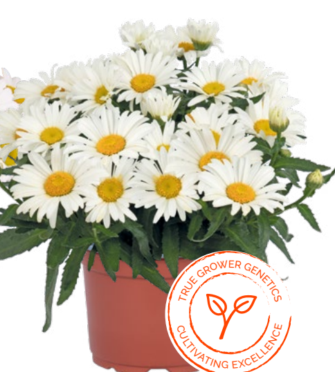
Leucanthemum maximum Sweet Daisy™ Christine 80392