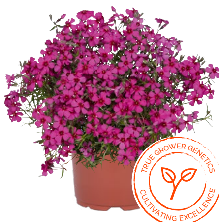
Phlox subulata Spring® Scarlet 82136