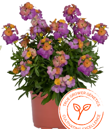
WallArt Berry Lemonade 82170