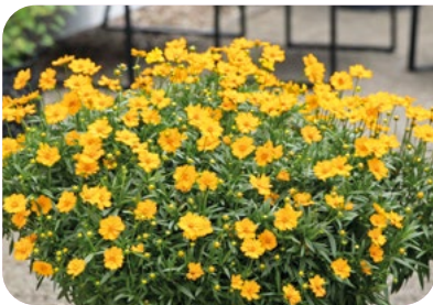
Coreopsis auriculata Limoncello Golden 81831