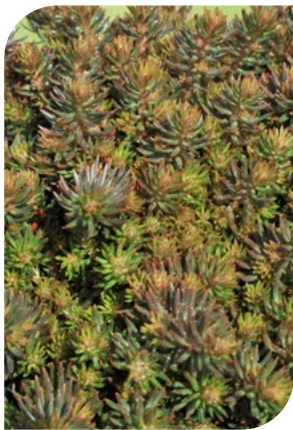
Sedum hakonense Chocolate Ball 81980