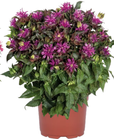
Monarda didyma Pocahontas Deep Purple 78056