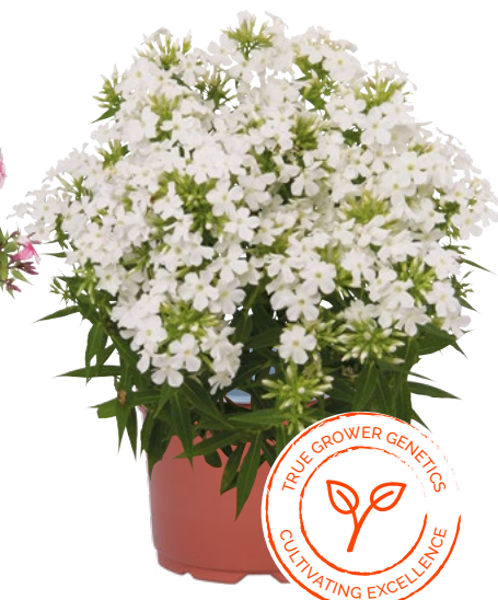
Phlox paniculata Early® White 80422