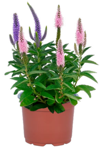
Veronica Candela Mix