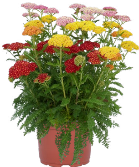
Achillea millefolium Skysail Trio