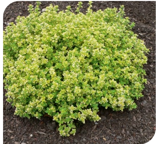
Thymus Gold Lemon 88007