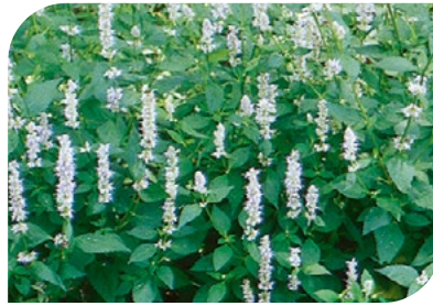
Agastache foeniculum Blue Fortune 81757