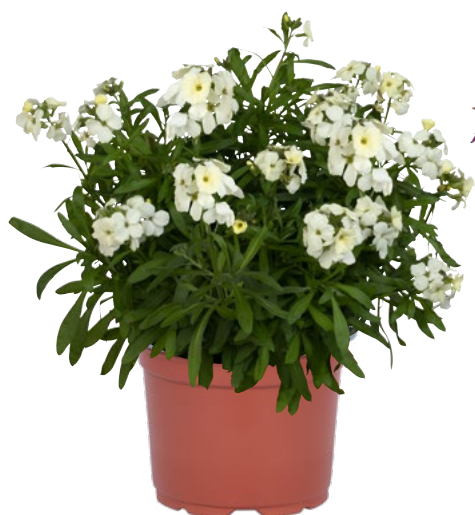
WallArt Pearl 82164