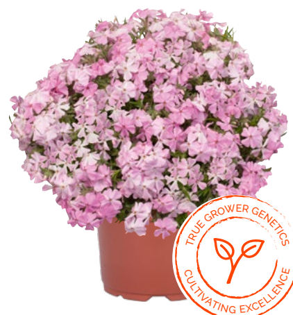
Phlox subulata Spring® Soft Pink 82146