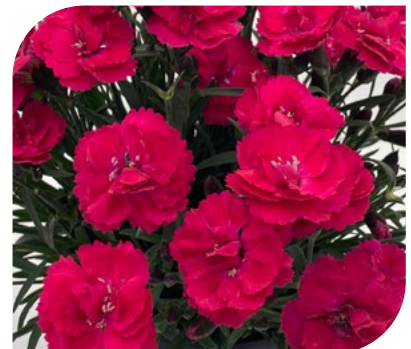
Dianthus caryophyllus Rock Double Purple 17879