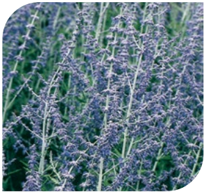
Perovskia atriplicifolia Russian Sage 88402