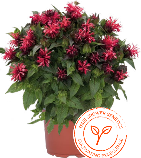
Monarda didyma Pocahontas Red Rose 78054