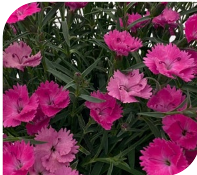
Dianthus caryophyllus Rock Pink 17881