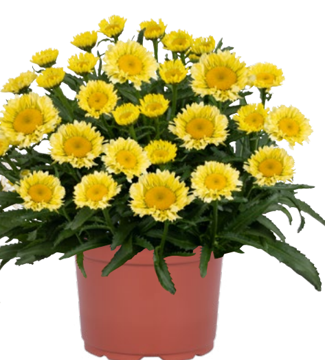
Leucanthemum maximum Sweet Daisy™ Izabel 84023