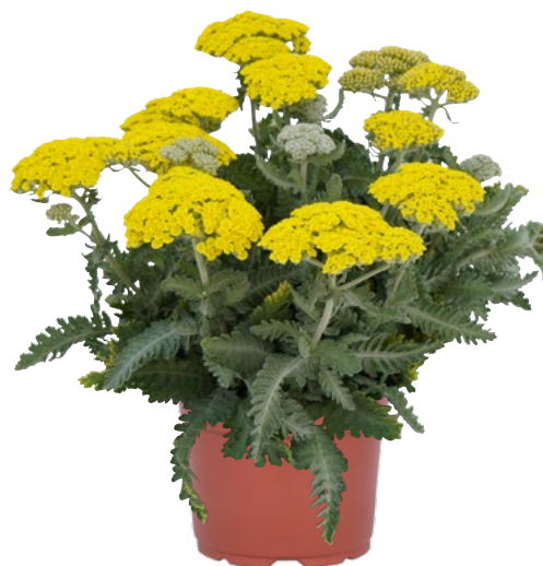
Achillea clypeolata Moonshine 81754