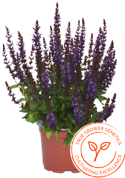
Salvia nemorosa Salute Blue 87070