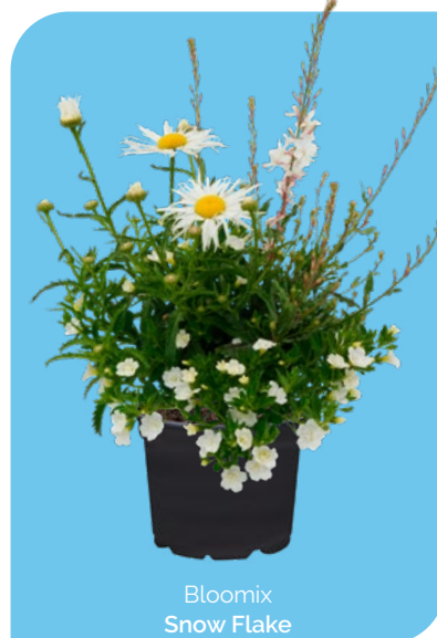
Bloomix Snow Flake