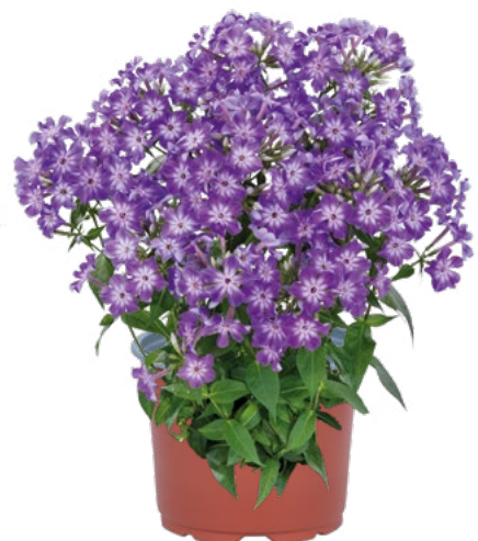
Phlox paniculata Early® Purple Eye 80164