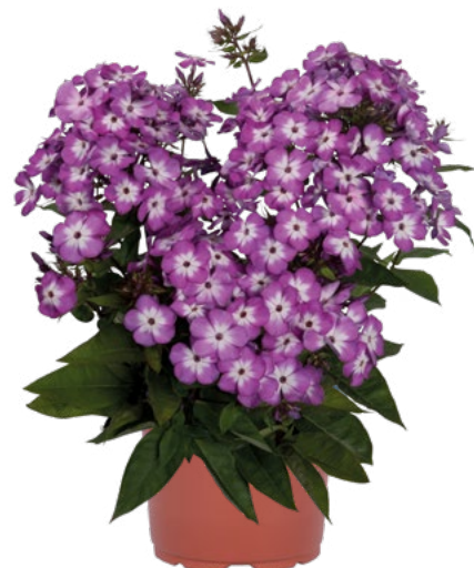
Phlox paniculata Flame® PRO Purple 80931