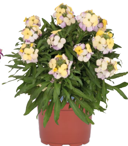
WallArt Pink Lemonade 82110