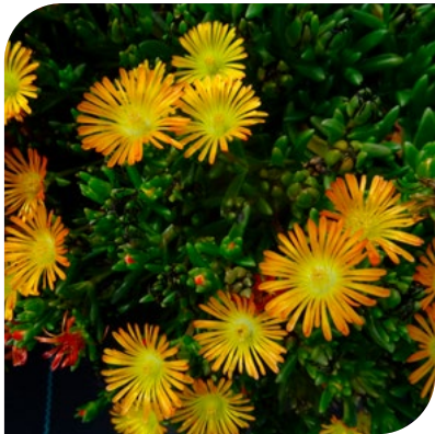
Delosperma cooperi Solstice Orange 84107