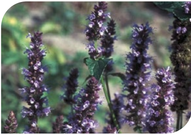
Agastache rugosa Black Adder 81761