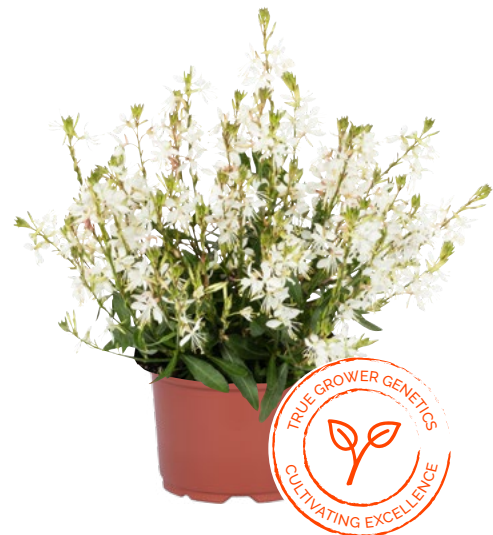
Gaura lindheimeri Graceful Blush 71342