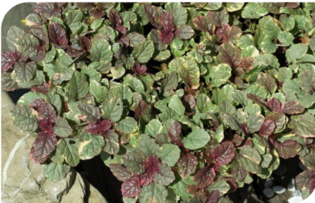
Ajuga reptans Burgundy Glow 76009