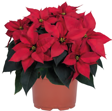
Scandic® Early 2.0 10304 8 weeks

Scandic® Early 2.0 stands out with tight nanobracts, ideal for high-quality mini production. Its naturally narrow habit enables efficient high-density cultivation and a clean, elegant plant form. With excellent branching and a strong root system, it ensures uniform development and consistent performance for compact formats without compromising quality.