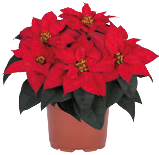
Freya 11421 7.5 weeks