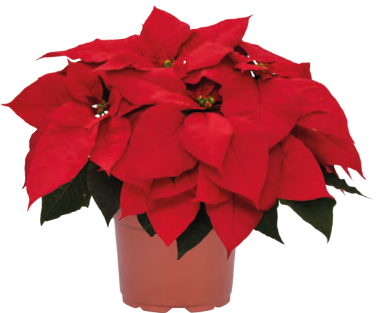
Premium Red 10230 7 weeks