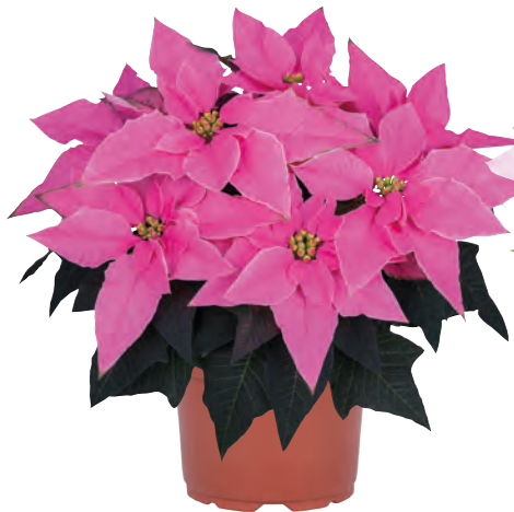
J'Adore Pink 10381 7 weeks