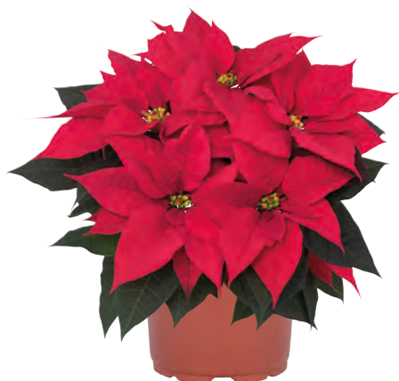
Embla 11420 8.5 weeks

Embla features slightly upright bracts and a strong V-shaped structure, creating a well-balanced and visually appealing plant. Its long sales window ensures extended display potential, while its robust habit makes it easy to pack and transport. Embla combines durability with reliable performance, offering growers a versatile and high-quality variety.