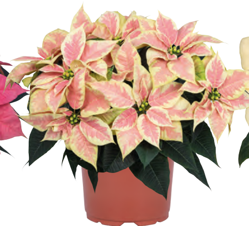
Freya Marble 11126 7.5 weeks