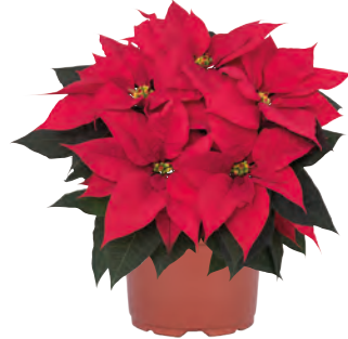
Embla 11420 8.5 weeks