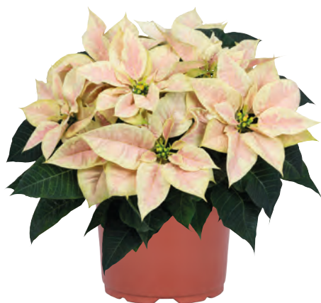
Embla Marble 11120 8.5 weeks