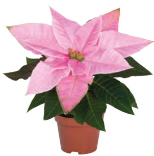
J'Adore Pink 10156 7 weeks