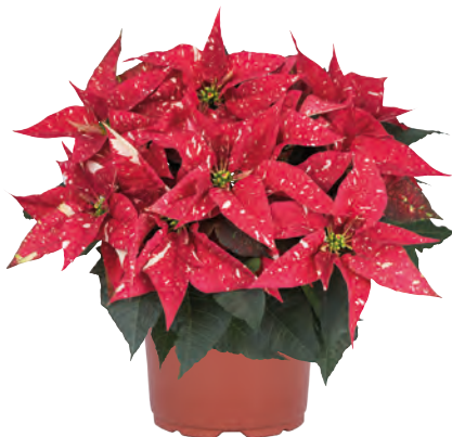
Matinee Glitter 10153 8 weeks

Matinee Glitter displays vibrant red bracts with white jingle, beautifully set against dark foliage. Its classic star-shaped bracts and showy cyathia create a striking presentation, while very strong stems and a robust root system ensure reliable growth. It offers growers an early, high-quality option with outstanding appeal.