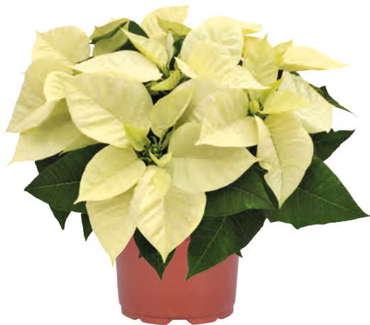
Premium Polar 10243 7.5 weeks