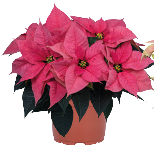
Freya Pink 11057 7.5 weeks