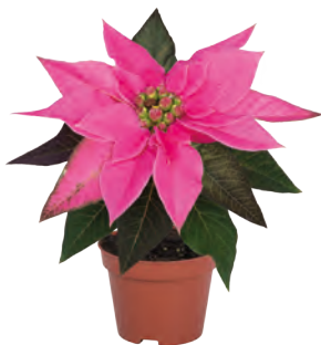
J'Adore Dark Pink 10154 7 weeks