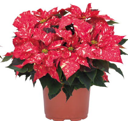
Primero Red Glitter 11317 8.5 weeks