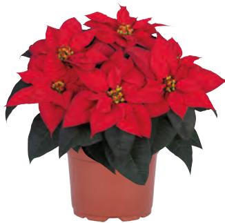
Freya 11421 7.5 weeks