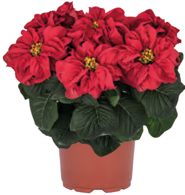
Winter Rose® Early Red 10993 7.5 weeks

An early-season specialty variety, Winter Rose® Early Red has ruffled bracts which resemble roses. The narrow plant habit is great for straight-ups and combination plantings for a unique holiday look.