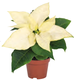
Freya White 11058 7.5 weeks