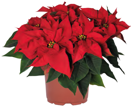
Prima Vera 10881 8 weeks