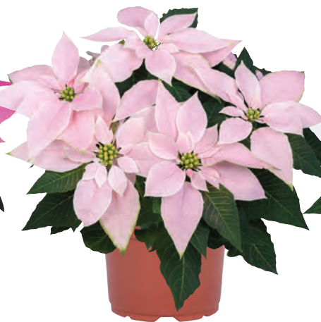
J'Adore Soft Pink 10156 7 weeks