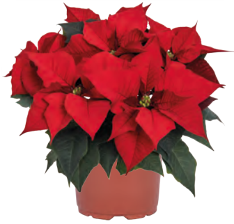
Nordic Star 11087 7.5 - 8 weeks