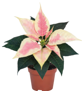
Freya Marble 11126 7.5 weeks

The mini poinsettias provide a high-density, short production cycle option. Dümmer Orange offers a URC cutting specifically produced with mini production in mind. These varieties have a smaller bract size, natural compactness, and excellent shelf life, making them an easy choice for mini production.