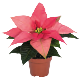
Freya Pink 11057 7.5 weeks