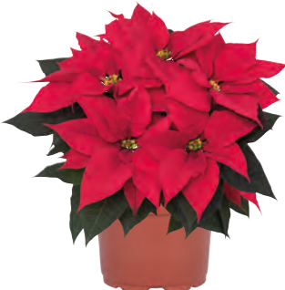
Embla 11420 8.5 weeks