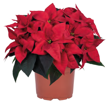
Noblesse 11068 8 weeks