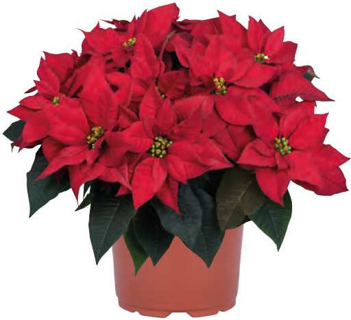
Rapid Red 11121 6 weeks