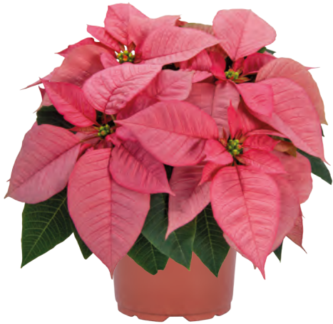
Premium Lipstick Pink 10235 7 weeks