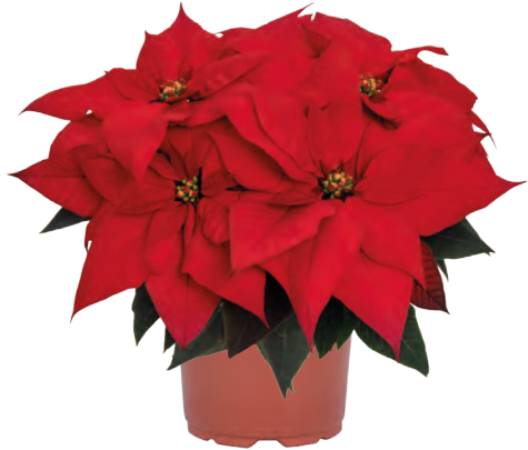
Ferrara 10897 8 weeks