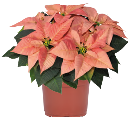
Viking Cinnamon 10657 8 weeks

This mid-season variety is both heat-tolerant and well-suited for cold finishing. Viking Cinnamon displays a V-shaped architecture that is perfect for high-density production. The unique pink-orange bracts make it a standout choice for festive displays.