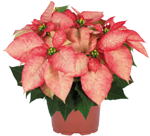
Premium Picasso 10234 7.5 weeks