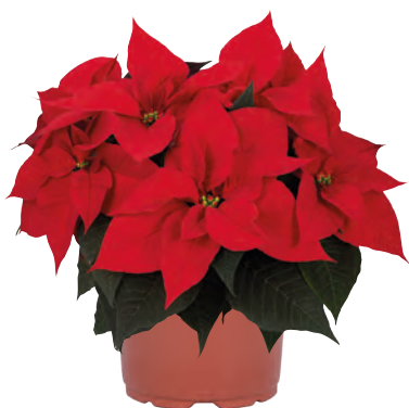
Imperial 10143 8 weeks