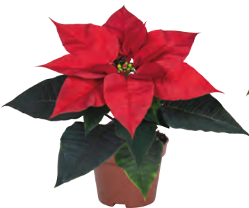
Signe 10335 8 weeks