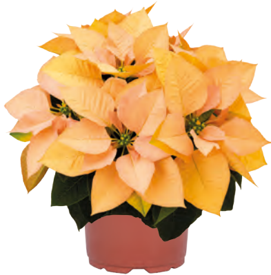
Autumn Leaves 11326 7.5 weeks

Autumn Leaves features a stunning yellow-to-apricot color range with striking contrast against dark green foliage. Its compact habit and strong branching ensure uniform, well-structured plants. Early coloration makes it perfect for early-season sales, combining visual appeal with reliable performance.