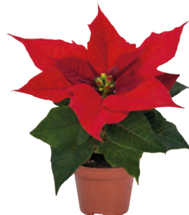
Scandic Early 2.0 10304 8 weeks