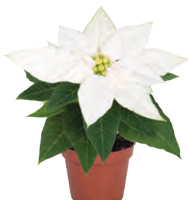
J'Adore White Pearl 10155 7 weeks