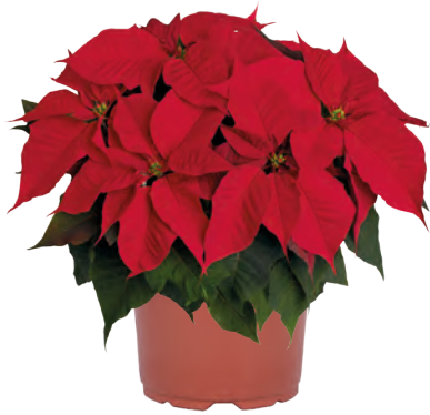
Bella Italia Red 10610 8 weeks

Bella Italia Red showcases large, even bracts that create a bold and elegant presentation, making it a striking centerpiece in any assortment. Its durable cyathia ensure long-lasting quality, supporting excellent shelf life throughout the entire sales period. Perfectly suited for standard to large pots and tree forms, Bella Italia Red offers growers a versatile variety.