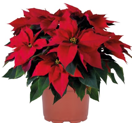
Primero Red 11310 8.5 weeks