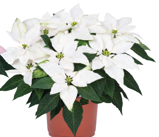
J'Adore White Pearl 10155 7 weeks