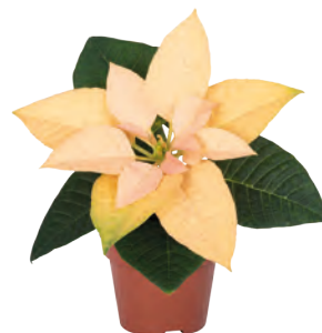
Autumn Leaves 11326 7.5-8 weeks