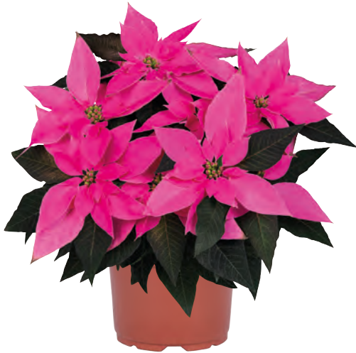
J'Adore Dark Pink 10154 7 weeks