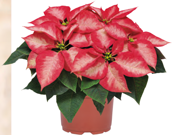
Premium Ice Crystal 10244 7.5 weeks