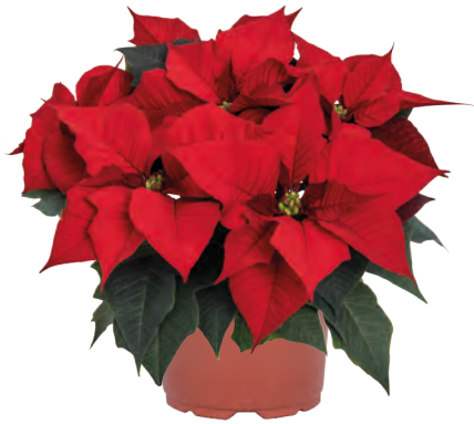
Nordic Star 11087 7.5 weeks