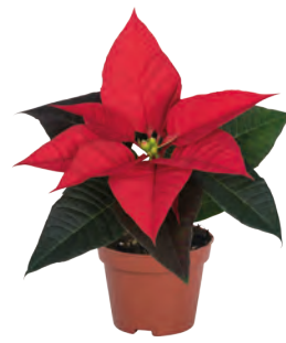
Freya 11421 7.5 weeks