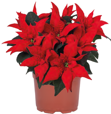
Jester Red 10994 7.5 weeks

Jester Red features distinctive upright bracts and a narrow, compact habit, creating a clean and elegant plant structure. Its naturally strong growth requires little to no PGRs, making it easy to cultivate. Suitable for cold-grown production and finishing, Jester Red delivers consistent quality and uniformity, even in high-density production.