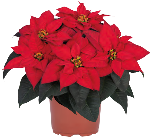
Freya 11421 7.5 weeks

The Freya family series is perfect for early season sales, offering harmonious finishes from mini pots to combination containers. Its compact to medium growth with a V-shaped habit makes it an ideal series for high-density production.