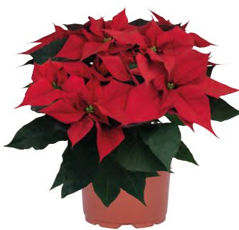
Signe 10335 8 weeks