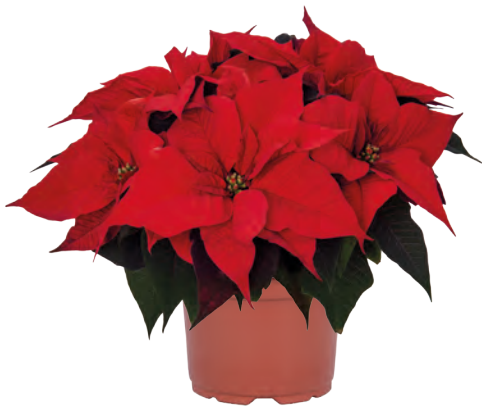
Grande Italia 10330 8 weeks

Make a statement with this showstopping red variety, perfect for late-season quality sales. This high-vigor poinsettia fills out larger containers nicely with large and dramatic, deep red bracts. Cyathia are slow to open, providing the longest-lasting quality throughout the season.