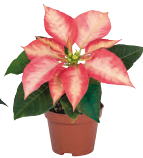
Premium Ice Crystal 10244 7.5 weeks