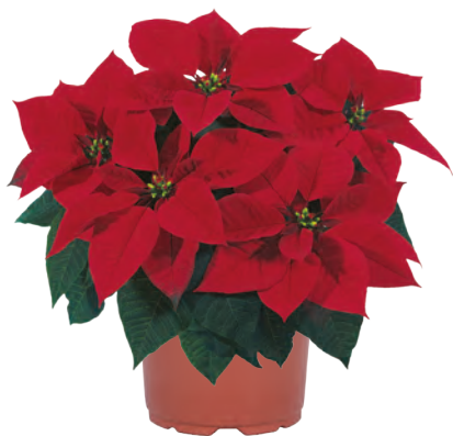
Euroglory Red 10220 8.5 weeks

Euroglory Red features dark red, medium-sized bracts that create a bold and attractive display. Its sturdy habit makes it grower-friendly and easy to produce, while excellent durability ensures it is suitable for long transportation. Euroglory Red combines strong visual appeal with reliable performance throughout the production and sales cycle.