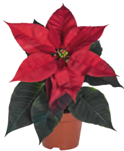
Nordic Star 11087 7.5 weeks