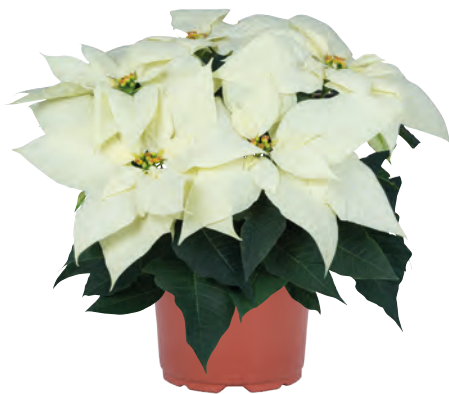
Moni 11094 8 weeks