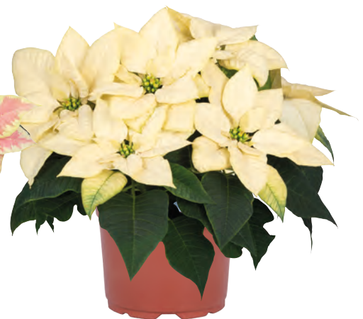
Freya White 11058 7.5 weeks