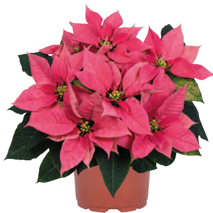
Embla Pink 11101 8.5 weeks