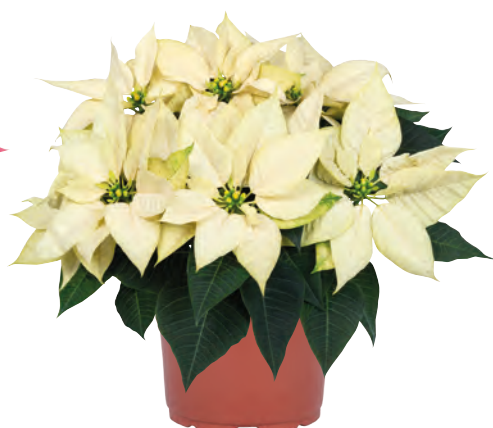
Embla White 10378 8.5 weeks