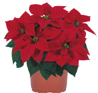
EuroGlory Red 10220 8.5 weeks